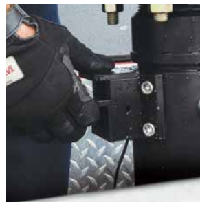
Easy-op latch design for safe and simple deployment