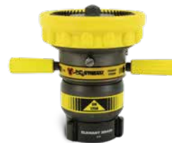
SM Series Automatic Nozzle

This is intended as a guide only. For all options and configurations, please contact your Elkhart Brass Regional Sales Manager or Customer Service.