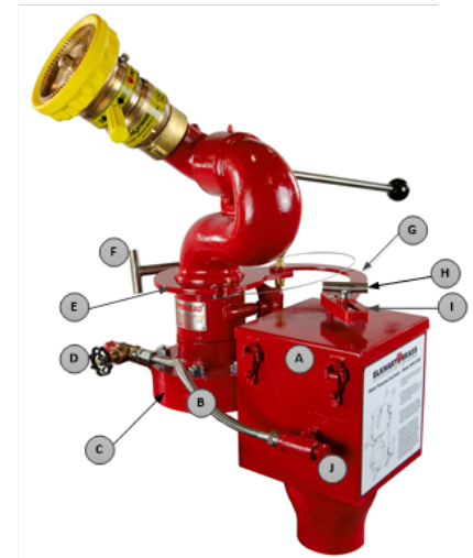
A – Water turbine enclosure B – Bypass hose connection flange to water turbine C – Flange D – Speed control E – Swivel clamp F – Oscillation centering control T-handle G – Connecting link H – Angle of oscillation adjustment knob I – Crank arm J – Test connection plug

Water powered monitor oscillator systems enable automation of fixed monitor fire protection systems without the need for running electrical wires. The Elkhart Brass WPO-2000 can simply be turned on by flowing the monitor when the standpipe valve is opened either locally or via remote valve controls. Unlike traditional water powered oscillator systems which require taking the monitor and water powered oscillator out of service and using specialized tools before the arc of oscillation can be adjusted, the Elkhart Brass WPO-2000 can be adjusted while the monitor is flowing by simply adjusting the arc of oscillation knob along the crank arm. This ensures reliability and efficient firefighting operations in case of an emergency. It also enables rapid and decisive tank farm cooling and tank farm firefighting with little to no human intervention.