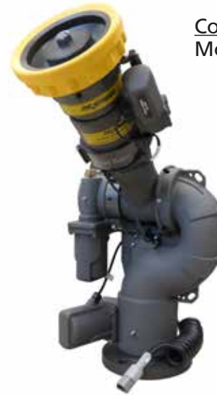
Cobra™ EXM Mo. 7250 SD