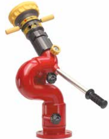
TILLER BAR (2)