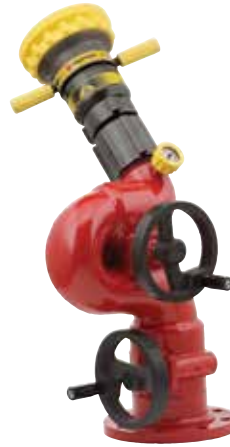
HAND WHEEL (1)