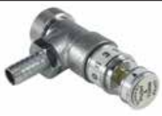
POSITIVE SETTING VALVE