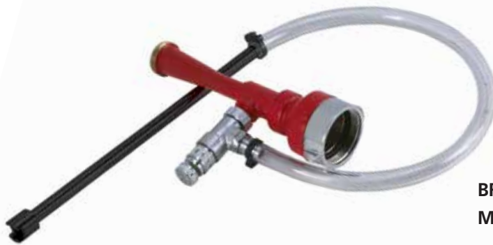
BRASS INLINE EDUCTOR MO. 241