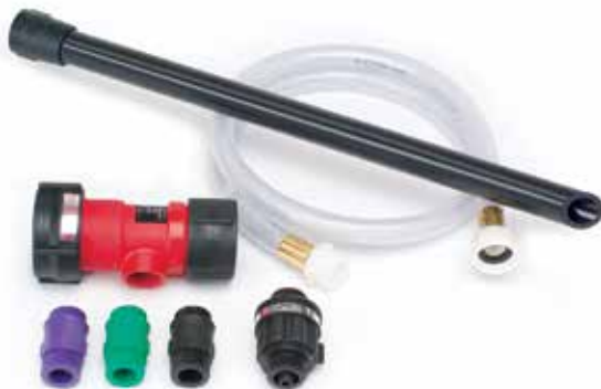
COMPOSITE INLINE EDUCTOR MO. 242