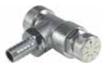
INFINITE SETTING VALVE