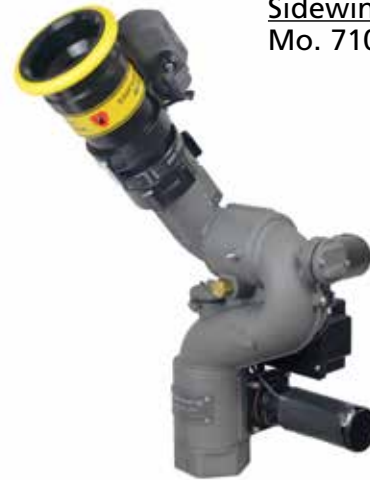
Sidewinder® EXM2 Mo. 7100 HD