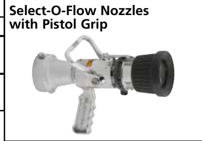
Figures depict general product types only and are not intended to be inclusive of all product features.